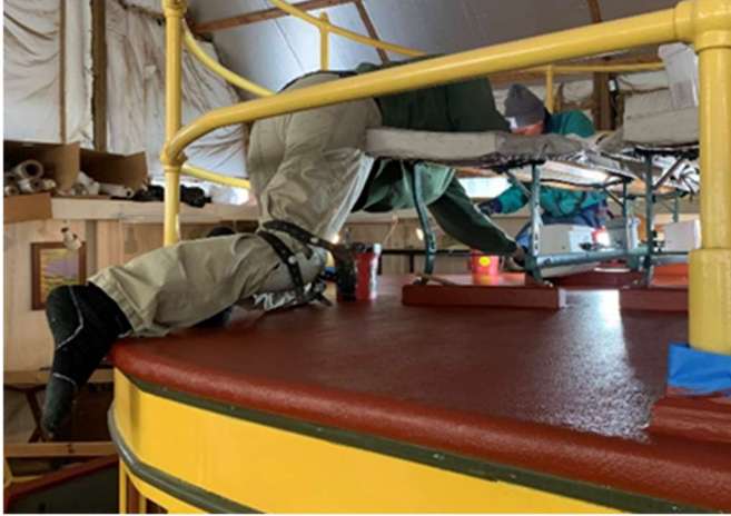
Have the maintenance crew become contortionists?