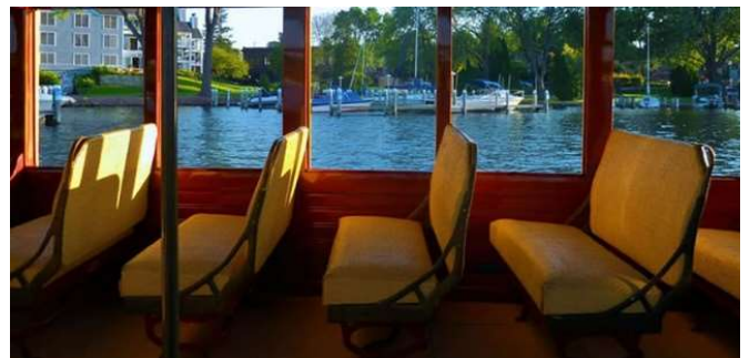
The seats as they now appear on the restored Minnehaha.