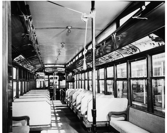
Cane seats pictured in one of TCRT's streetcars

A few original boat seats have been acquired and they're different. The boat seats aren't square on the wall side. They angle to match the curve of the hull. Cliff Brandhorst, who is building the new frames, believes that the seatback width was standard, and the front of the seat is what varied. That means the aft seats were a couple of inches wider in front, and forward seats were narrower in front. The boat seats didn't attach to the wall, but were free standing, supported on two streetcar-model pedestals. The footrest pipe was shorter, running between the two pedestals. Finally, there was a second curved side casting connecting the seat back and the cushion on the wall side. So, the seats look almost alike, but with those minor differences."