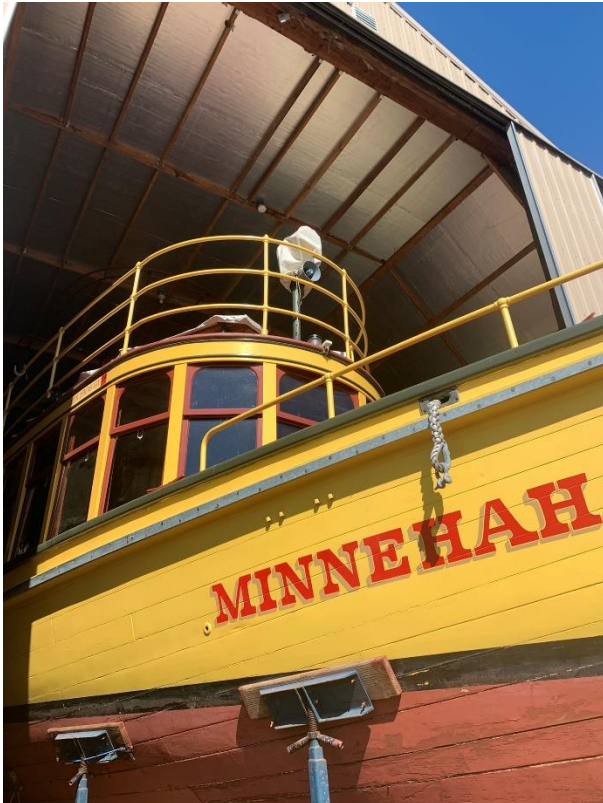
Minnehaha catches some final rays of sunlight as she’s eased back into the barn after being digitally scanned.